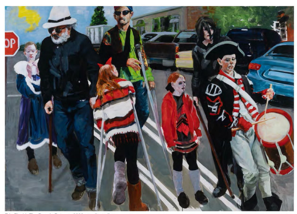
Eric Fischl, The Parade Returns, 2022, acrylic on linen © ERIC FISCHL / ARTIST RIGHTS SOCIETY (ARS), NEW YORK

AN: In The Parade Returns , it's hard to tell whose crutches are whose. Everyone looks like they are being propped up.