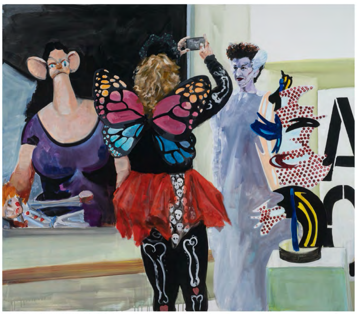
Eric Fischl, Halloween , 2022, acrylic on linen. © ERIC FISCHL / ARTIST RIGHTS SOCIETY (ARS), NEW YORK

mixed message—a butterfly wing and skeletal images. It's all aspects of life, death, femininity ...different images of women, some done by men.